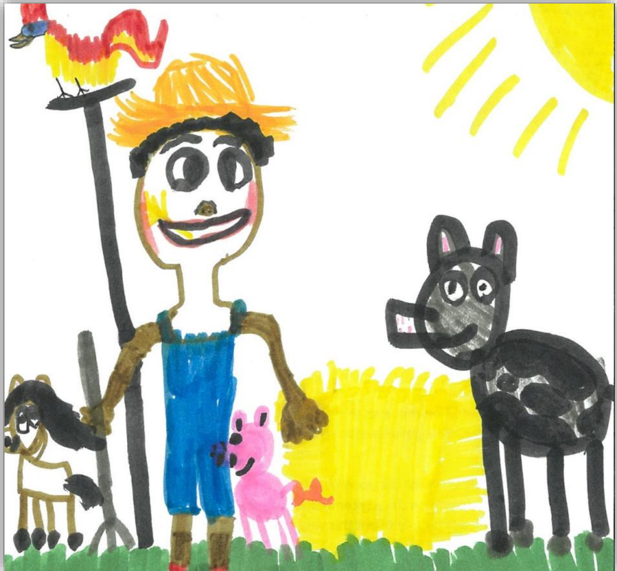
Back Cover Art by Gracy Glessing, Falun Elementary School